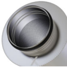
Spigot with lip seal