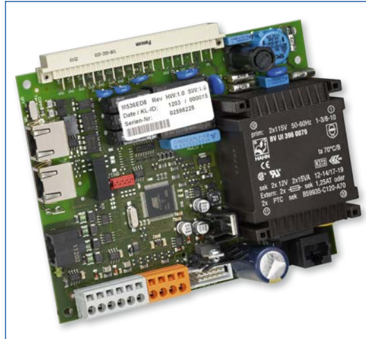
FSL-CONTROL II - Main PCB