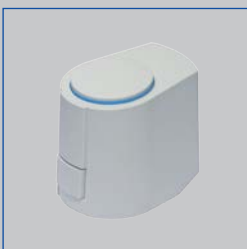
Valve actuator FSL-CONTROL II