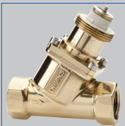
Pressure independent control valve