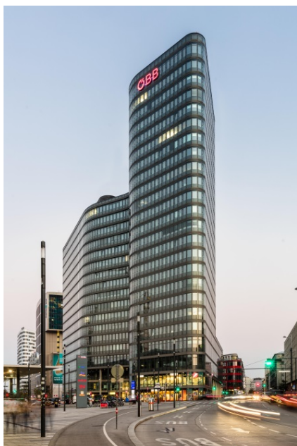
Exterior view of the new company headquarters.