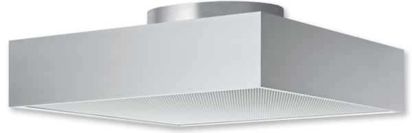
FHD – Construction without centre mullion