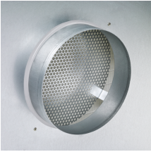
Spigot with fixed baffle plate