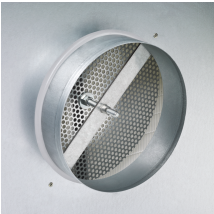
Spigot with adjustable baffle plate