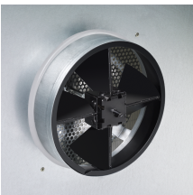
Spigot with damper blade