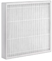
Z-line filter, construction NWO