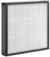
Z-line filter, construction PLA